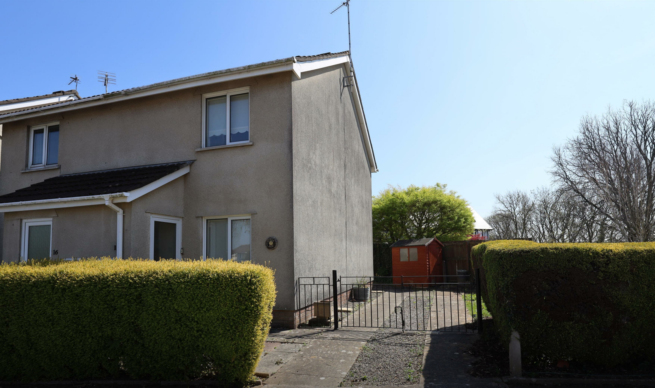
Casa Mia, 15 Crescent Close Cowbridge, Vale of Glamorgan, CF71 7EB